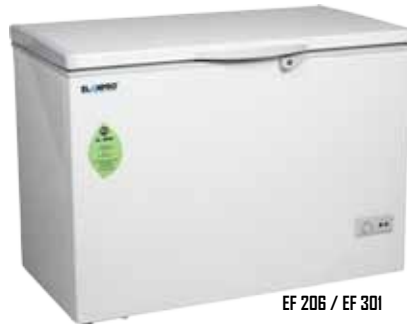
EF 206 / EF 301