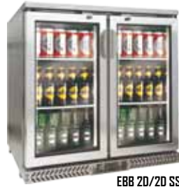
EBB 2D/2D SS

Elanpro Wine Chillers are known for their aesthetics and ease of operation, pull out wooden shelf helps in storage and selection of wine. Twin cabinet with individual temperature control ensures your White and Red wine are perfectly maintained to offer you the experience of Wine at any time. Elanpro back bar come in Black & SS finish.