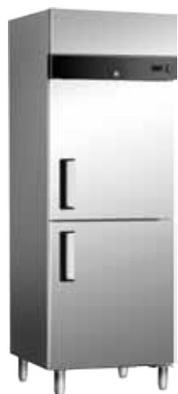
CGN 650 TNM / BTM RI 551 C2/F2