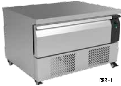
CBR - 1

Elanpro Flex drawer are designed to save space and enhance user experience at a touch of a button. The unique convertible feature helps in converting freezer to fridge and vice versa.