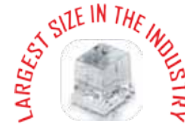
Regular Cube 28 x 32 x 22