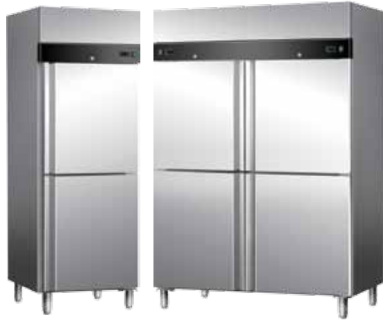
EGN 650 C2/F2

Elanpro Professional Reach Ins for refrigeration or freezer application are designed to meet the tough Indian Kitchen Conditions. Our machines are tested to perform in ambient environment of 43°C and presents a host of exciting new features.