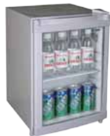
RF 61 G