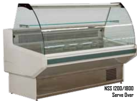
NSS 1200/1800 Serve Over

Available in a very wide range with various sizes to suit all applications. Our range includes: