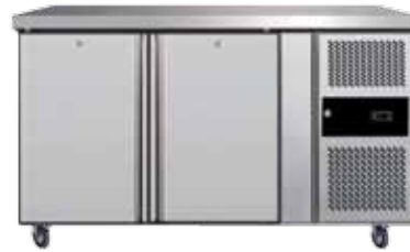
EGN 2100 C/F