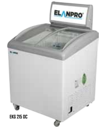
EKG 215 DC