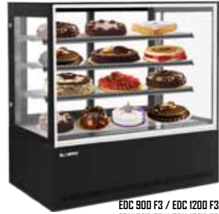
EDC 900 F3 / EDC 1200 F3 EDH 900 F3 / EDH 1200 F3

The stylish confectionery showcase range from Elanpro comes in multiple shapes and sizes with 3 and 4 layers of display option. Elanpro offers showcases in cold, hot and ambient temperature.