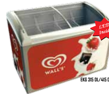
EKG 315 DL/415 DL