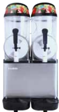
FB X 224