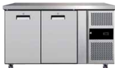
CGN 2100 TN / BT