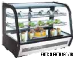
EHTC & EHTH 160/161 EHTC 100