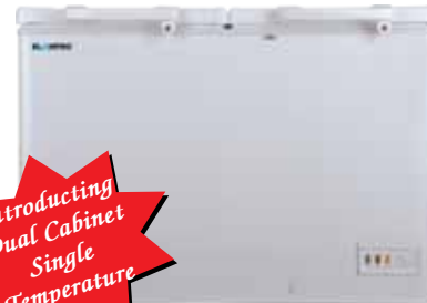
EF 315 DD

Elanpro convertible hard top chest freezers conveniently double up as chillers and freezer with the help of a knob and are available in a very pleasing white and grey shades in sizes ranging from 100 to 818 litres to suit every need. You can also choose between single, double and three lid variants.