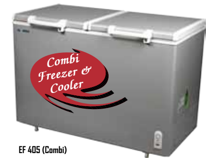
EF 405 (Combi)