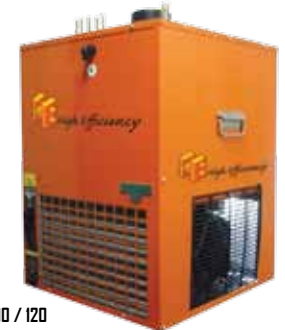
HE 90 / 120

Cooling unit to dispense extra cold beer between 0°C & 2°C and to frost the tower