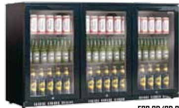
EBB 3D/3D SS