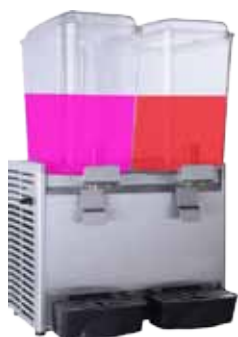
JD LJH 8x2