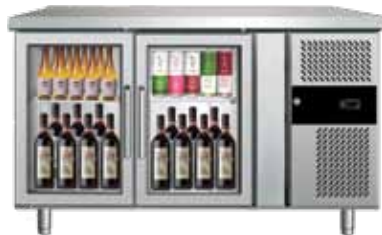
EGN 2100 CG