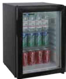
RB 41 G

Elanpro Minibars are designed keeping in mind the room aesthetics and noise less cooling performance for your discerning guest.