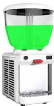
JD LJH 20