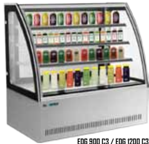
EDG 900 C3 / EDG 1200 C3 Grab & Go