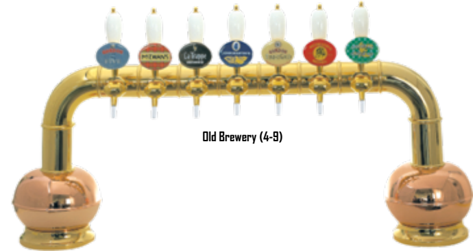
Old Brewery (4-8)