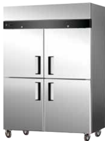
CGN 1410 TNM / BTM RI 1101 C4/F4