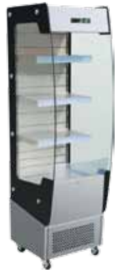
ABSS 220 - Multi Deck

Elanpro brings to India most advanced merchandising solution with innovative cooling options applicable for large hyper mart, super marts as well as modern day kirana stores. Leading brands like Big Bazar, Easy day, Nilgiri, More, CCD patronise on Elanpro solution for their display and merchandising application.