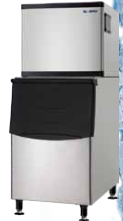
EIM 201 / EIM 351 / EIM 501