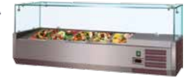
EVRX 1200 / EVRX 1400