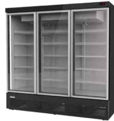
Plug-in Multi Door - Freezer & Chiller SL2D 131 / SL3D 197 / SL3D 210 SM2D 123 / SM3D 183 / SM4D 245