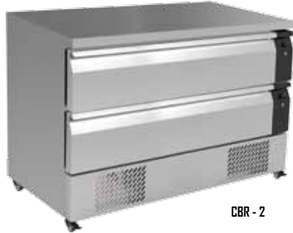
CBR - 2