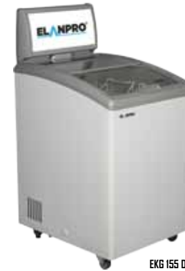
EKG 155 DC

Showcases Freezers - from 55 ltrs. to 650 ltrs.