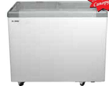
EKG 205A/305A/405A/650 Flat Glass (with optional Canopy)