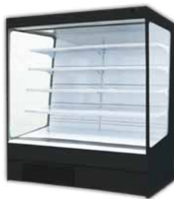
Plug-in Multi Deck / Remote Multi Deck SF 100 / 130 / 200 / 260 RF 188 / 250 / 375