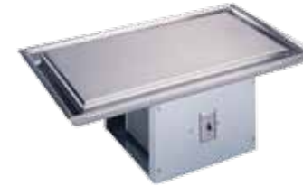
Frost Top 3F