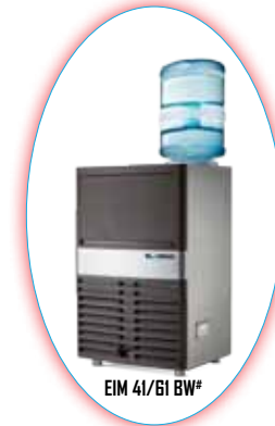
EIM 41/61 BW*