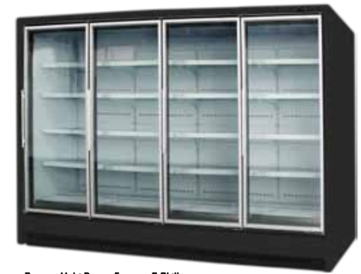
Remote Multi Door - Freezer & Chiller RL2D 156 / RL3D 234 / RL4D 312 / RL5D 390 RL2D 123 / RL3D 183 / RL4D 245 RM2D 123 / RM3D 183 / RM4D 245