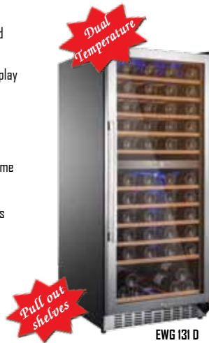
EWG 131 D