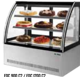
EDC 900 C2 / EDC 1200 C2 EDH 900 C2 / EDH 1200 C2