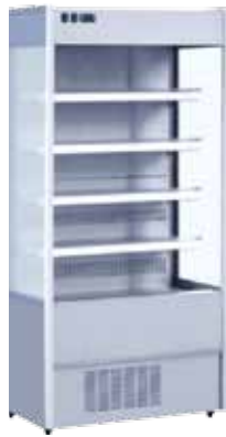
EPM 100 / 150 - Multi Deck