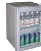
RF 61 G