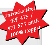
EF 455/EF 475 EF 555/EF 575